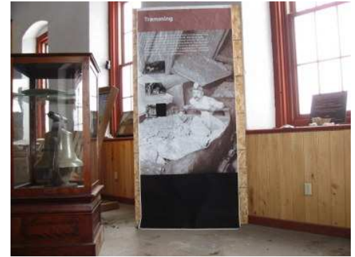
New interpretive panel under construction.