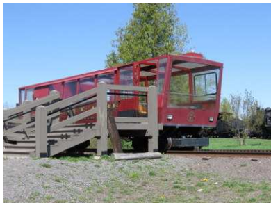
Tram at the end of the 2009 season

The Quincy Mine Hoist Association has begun the process of refurbishing the tram and tramway to preserve this attraction for many years to come. We have been able to keep up with the costs of regular