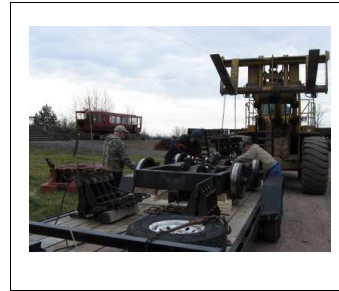
Volunteers loading the trucks for transport