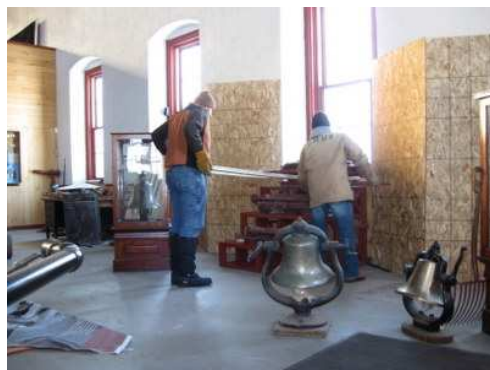
Setting up the underground drill display.

New interpretive displays under construction in the 1894 Hoist House Museum