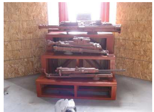
Underground drill display nearly complete.