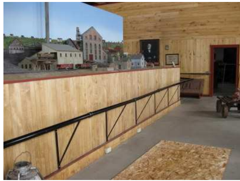
Train model before interpretive displays placed.