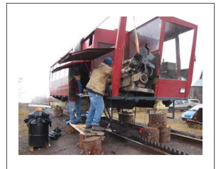
Dennis getting the engine ready for removal and inspection