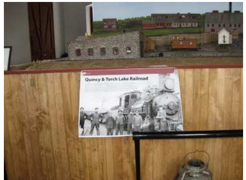
Rough draft placement of Q&TLRR panels.

New interpretive displays under construction in the 1894 Hoist House Museum