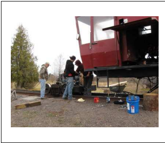
Volunteers and staff rolling out the trucks from under the tram.