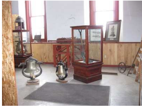
Museum at end of 2009 season.